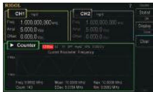
Statistic analysis function of counter