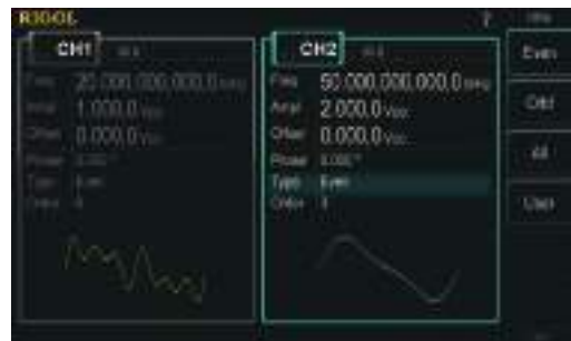
Up to 16 orders customized harmonic generation function