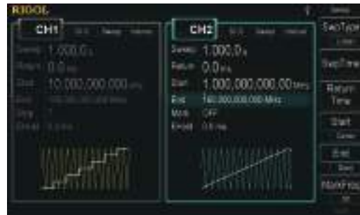
Various sweep modes