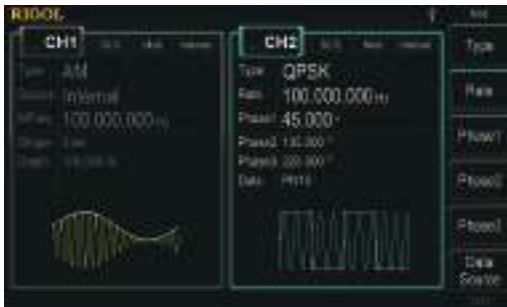
Abundant analog and digital modulation functions