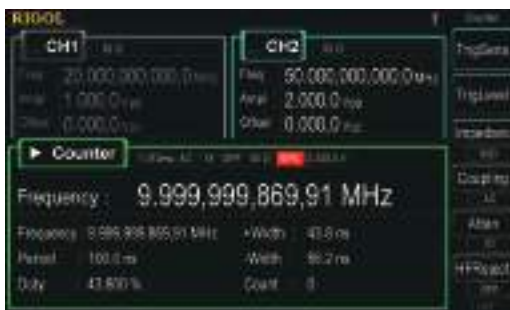
Standard high resolution counter function