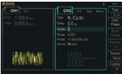
Noise and burst modes