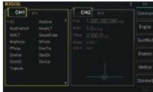
Standard arbitrary waveform function and 150 built-in arbitrary waveforms