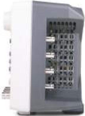
Product Dimensions: Width x Height x Depth = 313mm x 160.7mm x 116.7mm Weight: 3.2kg (Without Package)